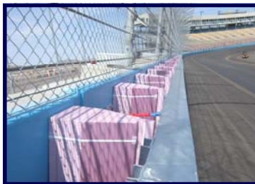
SAFER Barrier Extension -Dogleg