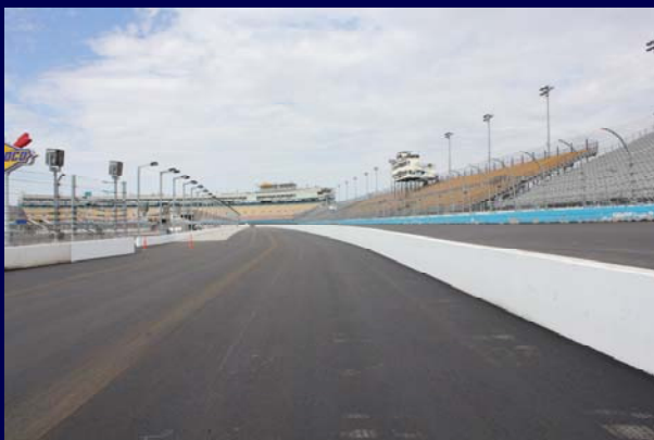
Pit Road & Frontstretch

What is next? The construction crews will begin to quickly restore the remaining work areas and help to prepare the track for the Kobalt Tools 500.