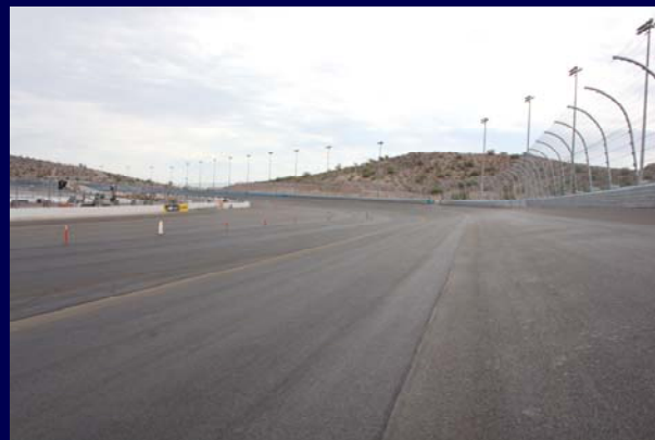
Backstretch & Dogleg