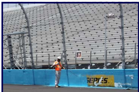
Frontstretch Exterior Wall Painting

With all of the new asphalt on the ground it's time to put the painters to work. The new inner and outer concrete walls are receiving their first coat of paint and the placement of the track's pavement markings will begin later this month and will be ready for the Goodyear tire test scheduled for August 29th and 30th.